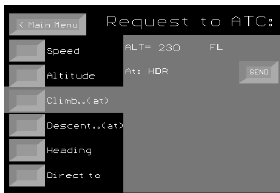
Figure 3: En-Route Clearances

One of the essential elements is the use of an advanced Flight Management System (FMS). In the mentioned European programs known as the Experimental FMS (EFMS 4 ).