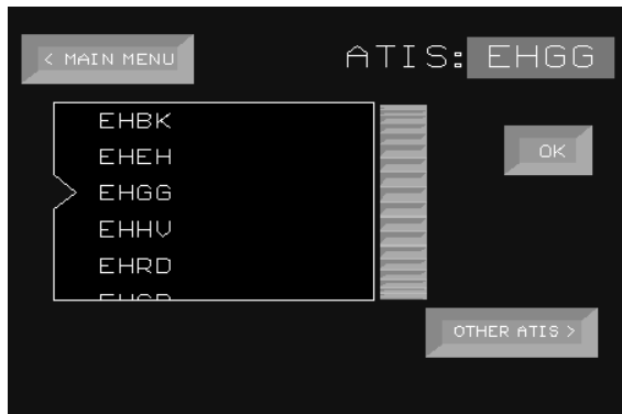
Figure 2: ATIS selection screen

tip on the screen, followed by a movement into the desired direction. The underlying HMI metaphor was that the words are attached to the drum. Based on the route information, a pre-selection is made of relevant airports to reduce the length of the list in order to speed up/ease the selection process.