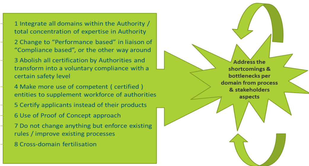
Figure 1. Options for changing certification and approval processes.