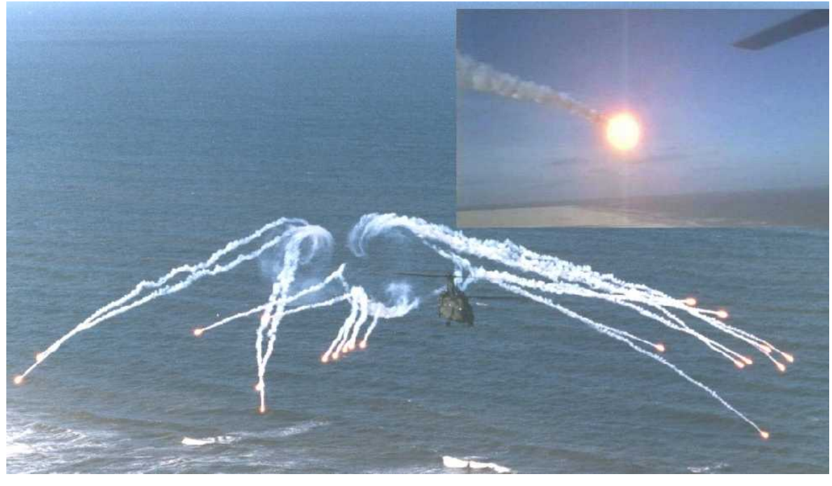
Fig. 2 Flare separation trials on RNLAF CH-47D Chinook

During the compliance demonstration phase, a structural analysis on the new structures was performed, a well as a vibration test. After integration of the new system, electromagnetic intersystem compatibility testing was conducted, in order to verify that the addition of the new system didn't influence the existing helicopter electronic equipment and vice versa. Also HIRF tests were conducted on the helicopter to check for Electro magnetic immunity. A flight trial campaign was performed with actual decoy firing to check for safe separation with the rotorsystem. A video camera system was installed to record the decoy behavior (fig.2).