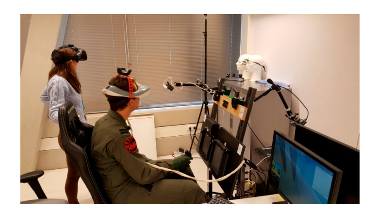
Figure 6: An Apache pilot flying the Virtual Cockpit during the third evaluation in the Cinoptics COBALT, while one of the researchers "hitch-hikes" along in the HTC VIVE.

The first reaction of the SMEs when experiencing the Virtual Cockpit was the immediate immersion in the virtual world: "You see your hands and the cockpit around you". Especially a video-captured, coloured representation of the hands – as opposed to artificial virtual hands – was appreciated. The SMEs found it easier to recognize their own hands when they saw their green flying gloves.