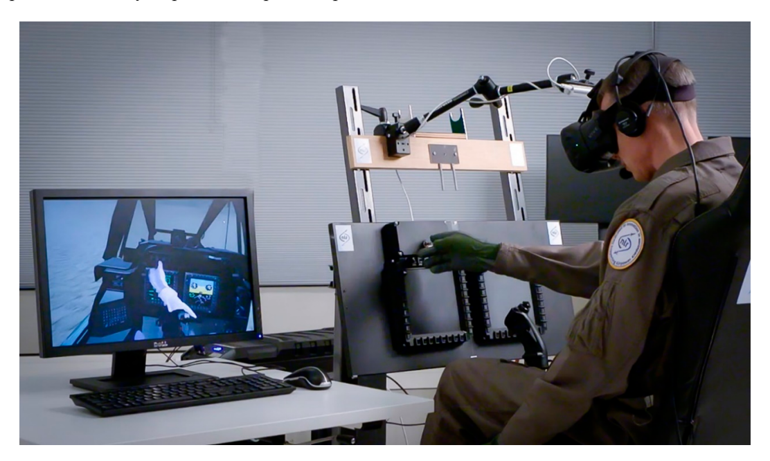
Figure 1: The Virtual Cockpit concept.

The Virtual Cockpit is a VR simulator (see Figure 1) in which a natural interaction with the physical world is possible. The virtual world looks and sounds like the real cockpit, while the hardware feels like the real cockpit. This is possible due to a newly developed interaction detection method, allowing the simulated cockpit to realistically respond to the pilot's input.