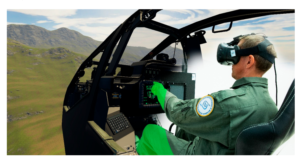
Figure 4: Illustration of the alignment between the physical and virtual layer.

On top of enabling the interaction detection, the sensor layer can also be seen as the glue which aligns the physical with the virtual layer. This mapping is realized by calibrating red markers on the wooden panel (see Figure 2-2 and 2-3) with corresponding locations in the virtual world. The location of the user in relation to the physical and virtual worlds is calibrated at the beginning of the session by determining the location of the headset. During start-up, the headset is placed in a small container in a fixed alignment position. Similar to the red markers, both the physical and the virtual environment know exactly where the headset is located. This calibration procedure takes a couple of seconds and results in a perfect alignment between the physical and virtual world, facilitating a smooth transition between the two (as can be seen in Figure 4) and leading to a higher level of immersion.