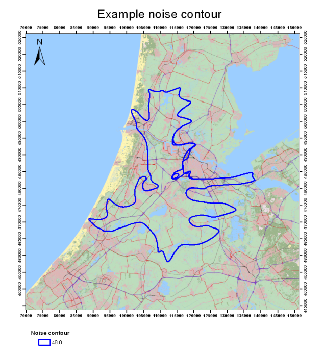
Figure 3 Example of a figure with a noise contour

A lot of interest has been received from clients that work in fields varying from defence to engineering in governmental and commercial sectors. Their main interest is the use of the architecture as a portal to their required GIS information and services.