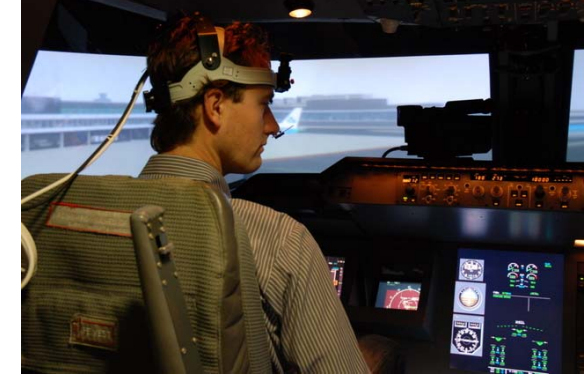
Fig. 2. Combining data streams. Pilot in simulator while several tools (e.g. eye tracker IR camera) are registering data.

For a number of HF tools it is clear that they measure aspects of an underlying concept. For example a set of HF tools was applied that all indicate mental workload. A number of these tools are sensitive as well to other concepts than mental workload. Some of them are sensitive to psychological stress, coffee intake, etcetera.