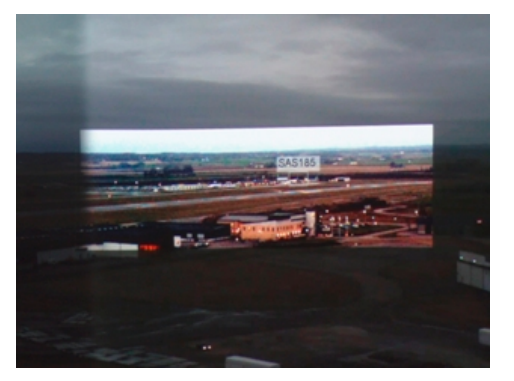
Fig. 2-2 Visibility enhancement for a part if the image

A sizeable part of a projected image can be improved by a digital real time Visibility Enhancement Technology (VET), see Fig. 2.2.