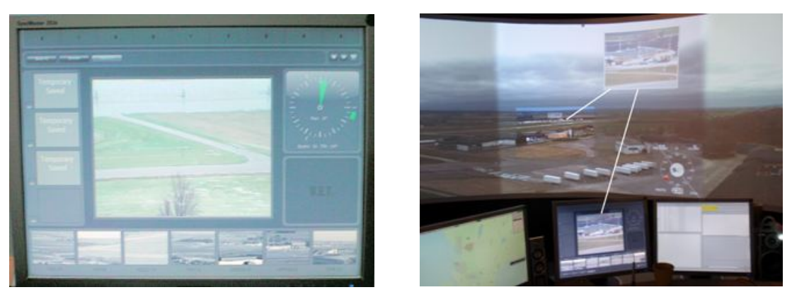
Fig. 2-6 Pan Tilt Zoom camera Human Machine Interface (left) and Picture in Picture (right)

steering is done by the mouse either on the PTZ monitor or on the panorama screen. The actual heading and zoom is indicated with on a compass rose in the right top corner. The PTZ camera can be slaved to a track and its image is also displayed on the panorama screen as a Picture-in-Picture (PIP) (Fig. 2-6).