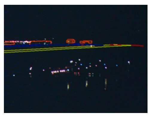
Fig. 2-3 Overlaid geographic information

Synthetic contour lines can be activated enhancing the runway and taxiway edges in low visibility conditions, see Fig. 2.3.