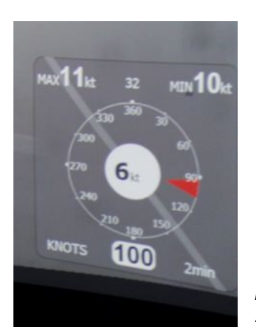
Fig. 2-4 Meteorological overlay with actual wind speed, direction , 2-minute average and minimum – maximum values