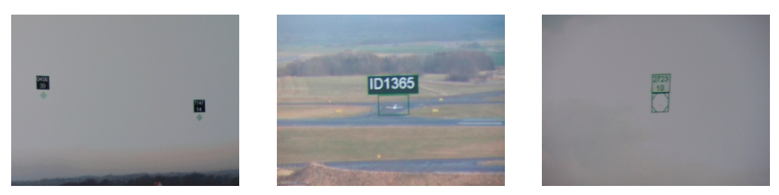
Fig. 2-5 Left: Aircraft tracked only by the Terminal Approach Radar (labels with call sign or SSR code and altitude in hundreds of feet); Middle: aircraft tracked by the video camera only (label with track number); Right: aircraft tracked by both radar and video

Objects observed by the video cameras are tracked in the central tracking unit. Radar tracks from the Approach Radar are merged with the video tracks; see Fig. 2-5 right part.