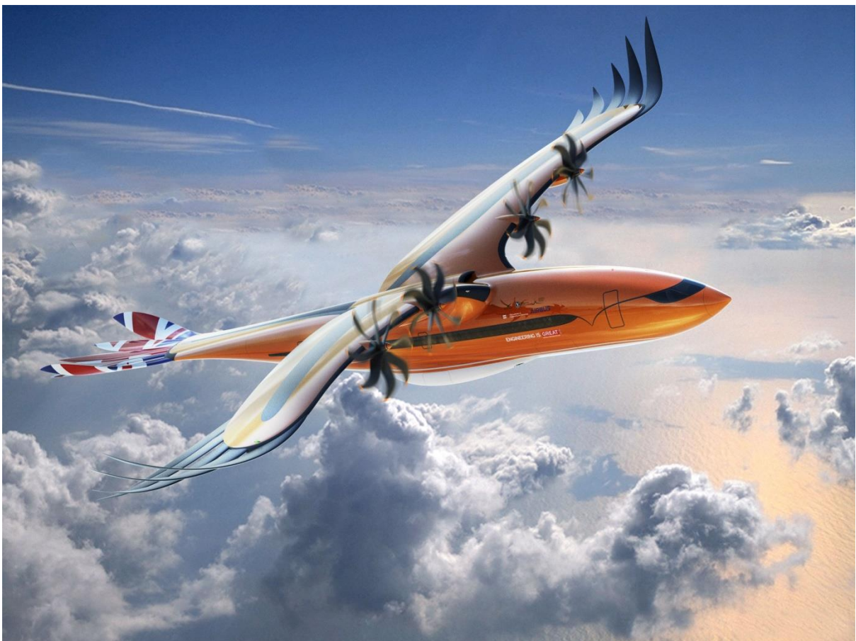
A bird-like conceptual airliner design by Airbus. The design is partly based on biomimicry and the goal of the design is to motivate the next generation of aeronautical engineers

One objective of the virtual flight tests in the optimization algorithm would be to determine the fatigue damage and static strength at every location during the entire service life based on the structural design, the intended mission profile and dynamic response of the design. Although the above described optimization algorithm and a complete digital twin are far beyond our reach in the short term, there are steps that can already be taken for the structural integrity aspects. Those steps address a variety of topics, such as material models, calculation and analysis methods, fatigue design philosophies, manufacturing technologies and structural health monitoring systems.