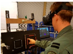
Figure 2-1: Configuration 1.1.

The physical layer consists of a simple wooden panel, which was cut to a size large enough to attach both a 3D-printed AH-64 Multi-Purpose Display (MPD) and a bezel of an F-16 Multi-Function Display (MFD), see Figure 2-1. The latter stemmed from a real F-16 Multi-Function Display and therefore resembles the haptic feedback of the actual MFD better. The 3D-printed buttons resemble the MPD better in regard to the distance between and the location of the buttons. This difference in size and matter made it possible to detect possible differences in the accuracy of the interaction detection, and in the natural feel of the haptic feedback.