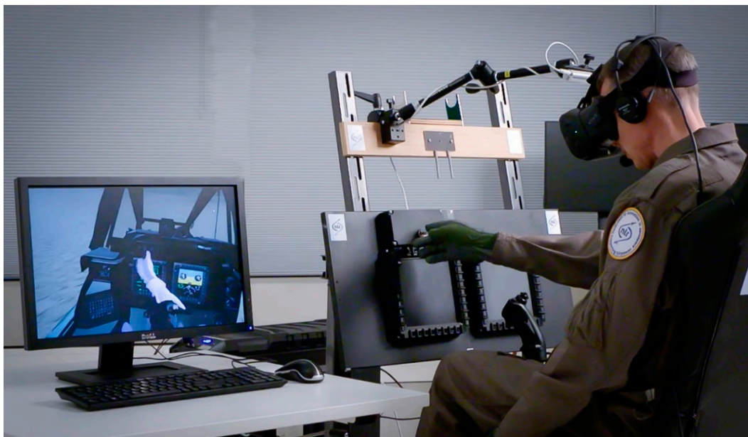
Figure 1: The Virtual Cockpit concept.

The Virtual Cockpit is a VR simulator (see Figure 1) in which a natural interaction with the physical world is possible. The virtual world looks and sounds like the real cockpit, while the hardware feels like the real cockpit. This is possible due to a newly developed interaction detection method, allowing the simulated cockpit to realistically respond to the pilot's input.