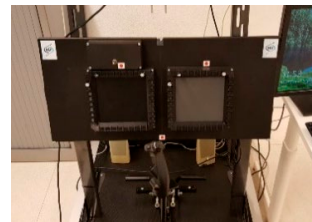
Figure 2-3: Configuration 3.

Based on the feedback by the operators, the 3D-printed buttons were improved over time to create a more realistic haptic feedback – a more natural ‘feel’. This was realized by using a push- and click mechanism (see Table 1), which feels similar to the actual MPD buttons in the AH-64.