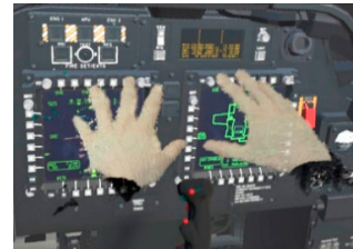
Figure 3-3: Colour image.

The hardware used to visualize the virtual environment was the HTC VIVE headset [13]. During the final evaluation, the HTC VIVE was compared to the Cinoptics COBALT [14] to study possible differences in user friendliness. The main differences between these two headsets are a) the weight (the COBALT is heavier), b) the resolution and c) the field of view (the COBALT's FOV is smaller, but has a larger amount of pixels per degree FOV).