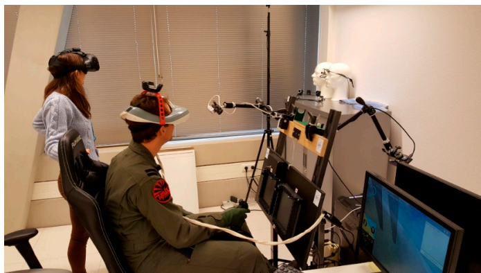
Figure 6: An Apache pilot flying the Virtual Cockpit during the third evaluation in the Cinoptics COBALT, while one of the researchers “hitch-hikes” along in the HTC VIVE.

The first reaction of the SMEs when experiencing the Virtual Cockpit was the immediate immersion in the virtual world: “You see your hands and the cockpit around you” . Especially a video-captured, coloured representation of the hands – as opposed to artificial virtual hands – was appreciated. The SMEs found it easier to recognize their own hands when they saw their green flying gloves.