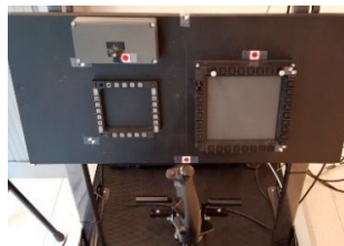
Figure 2-2: Configuration 2.