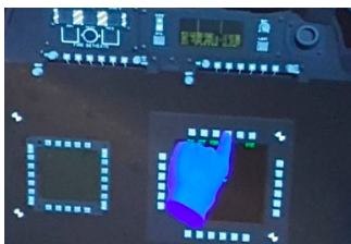
Figure 3-1: Virtual hand.

In configuration 1.2 and 1.3, the operator's hands were visualized as a 3D image of the actual hands (see Figure 3-2), which was possible due to using a different sensor. In configuration 2 and 3, this image was enhanced by overlaying the 3D hands with colour video (see Figure 3-3).