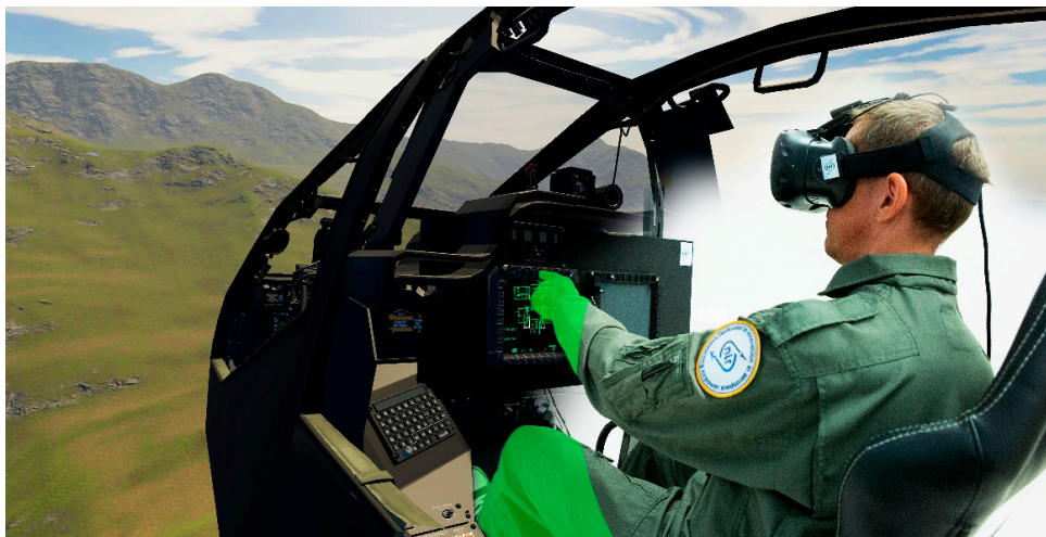
Figure 4: Illustration of the alignment between the physical and virtual layer.

On top of enabling the interaction detection, the sensor layer can also be seen as the glue which aligns the physical with the virtual layer. This mapping is realized by calibrating red markers on the wooden panel (see Figure 2-2 and 2-3) with corresponding locations in the virtual world. The location of the user in relation to the physical and virtual worlds is calibrated at the beginning of the session by determining the location of the headset. During start-up, the headset is placed in a small container in a fixed alignment position. Similar to the red markers, both the physical and the virtual environment know exactly where the headset is located. This calibration procedure takes a couple of seconds and results in a perfect alignment between the physical and virtual world, facilitating a smooth transition between the two (as can be seen in Figure 4) and leading to a higher level of immersion.