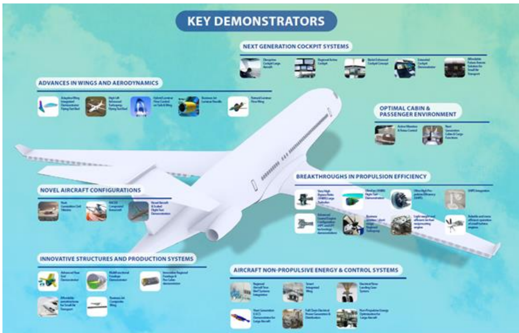
Figure 2 – Clean Sky 2 key demonstrators [www.cleansky.eu]

In addition to the three elements in which Clean Sky 2 technologies are developed, the Technology Evaluator (TE), as a Transverse Activity, has been established as an independent technology evaluator for the entire duration of the Clean Sky 2 Joint Undertaking. Its main task (as per Council Regulation (EU) No 558/2014) is to monitor and assess the environmental and societal impact of the technological results arising from individual ITDs and IADPs across all Clean Sky 2 activities, specifically quantifying the expected improvements on the overall noise, greenhouse gas and air pollutants emissions from the aviation sector in future scenarios in comparison to baseline scenarios.